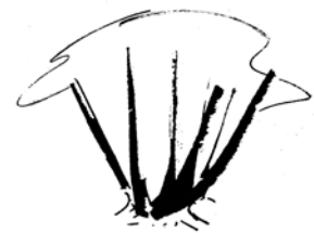
Clump Style (Single Root Base)

There are several ways to create multi-trunked bonsai. Some species naturally form clumps (quince, azalea), while others, like maples, send off numerous shoots if the trunk