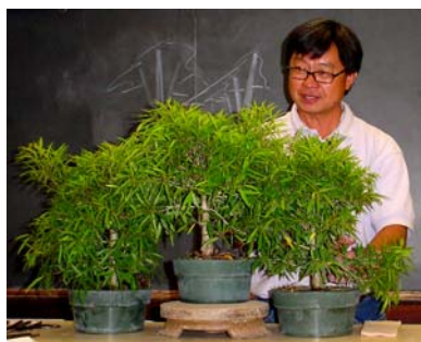
Choosing relative positions

The ficus responds well to aggressive root pruning, so many of the large roots were pruned back to "fit" the trees into position. Excess material was removed to open up the bonsai, making it look more like a tree and less like a bush. The upper branches were thinned to allow more light to the lower branches, improving the growth balance.