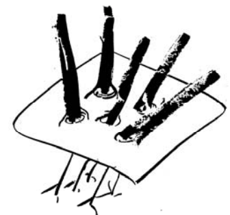
Air-layered to create fused roots

The ficus responds well to aggressive root pruning, so many of the large roots were pruned back to "fit" the trees into position. Excess material was removed to open up the bonsai, making it look more like a tree and less like a bush. The upper branches were thinned to allow more light to the lower branches, improving the growth balance.