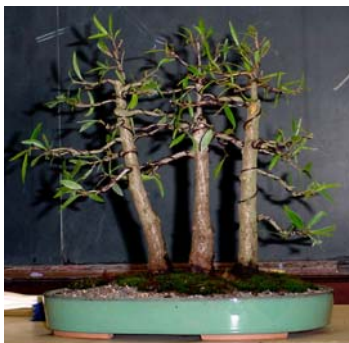
The Finished Bonsai

Finally, it was placed in a proper bonsai pot and presented to the club.