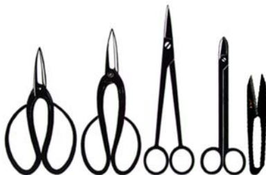
Assorted Bonsai Scissors

Trunk Splitters – Used primarily for jin/shari techniques, also for bending/twisting larger branches and trunks. Although not a "Must Have" for beginners, they are very nice for some advanced techniques.