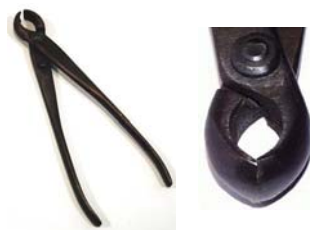
Knob Cutter and Closeup

Knob Cutter – A first cousin to the concave cutter. This is a specialized tool that is great for removing protrusions such as old scar tissue from trunks and branches.